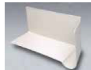
Copyright © 2009 DryFlect. All rights reserved.